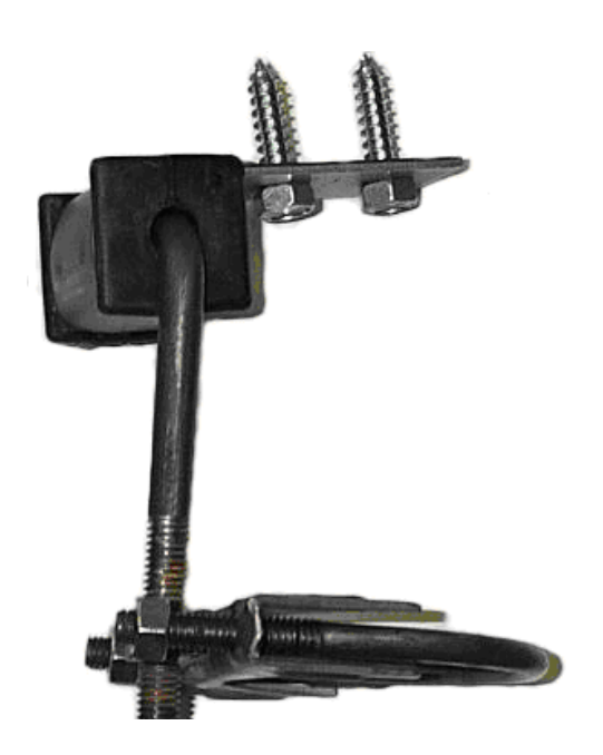
Front tail pipe hanger assembly