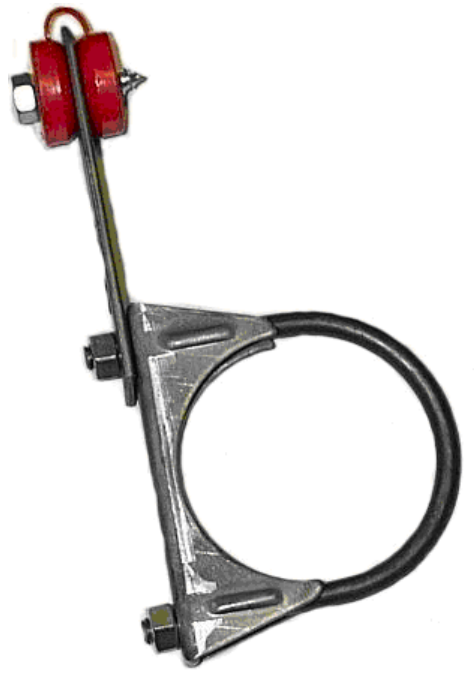
Rear tail pipe hanger assembly

Rear tail pipe hanger consists of a metal strap (ST4), snapper grommet, lag screw, and clamp (see illustration). Front tail pipe hanger consists of a BR92256 rubber mount for wire hanger, and a # 2743 2-1/2" hanger clamp with adjustable threaded rod hanger, and two lag screws.